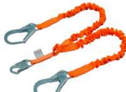
Miller Titan™ II Stretch Tubular Built-In Shock-Absorbing Lanyards by Honeywell