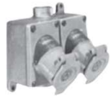
Explosion-Proof Receptacle, EFSC Series 20 Amp, Appleton