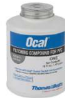
PVC Touchup Compound 16 oz Exterior Gray Patch P-G T&B Ocal