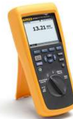
Fluke 500 Series Battery Analyzer