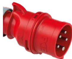
CEE-plugs 16/32A Series SHARK