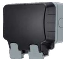
RCD Protected Sockets (Storm Weather Proof) by British General