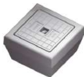
Concrete Inspection Pit 320 x 320 x 190 mm PT 005 Furse