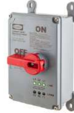
Circuit Lock Disconnects The highest-performing motor disconnects for every environment