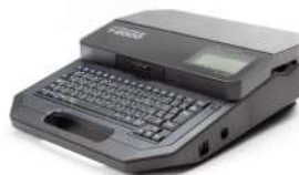
FERRULE PRINTER T1000 PROMARK PARTEX