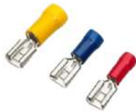
Pre-Insulated Terminal Female 1.5 mm2 x 4.8 mm Blue