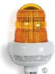
Tomar 4375L Explosion Proof Warning Light - Intrinsically Safe Store