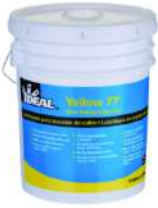
Cable Pulling Compound 5 gal Ideal