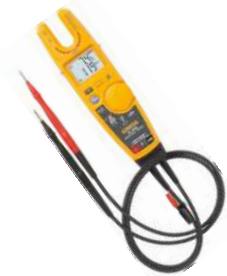
Fluke T6-1000 Electrical Tester