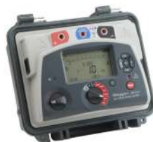
INSULATION RESISTANCE TESTER METER 5KV MEGGER MIT515