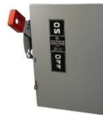
GENERAL ELECTRIC - Safety Switch, 100A 3P 240V Fusible