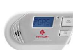
1039760 Combo Explosive Gas And Carbon Monoxide Alarm With Digital Display