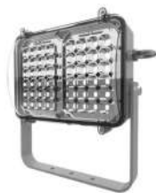
Flood Light Fixture LED Cool White Chalmite