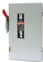
GE 60 Amp 240-Volt Fusible Indoor General-Duty Safety Switch Tg3222