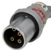
Appleton - Plug, 60 Amp - 4 Pole