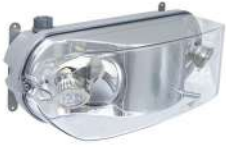
Hazardous Location LED Emergency Light