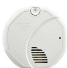
3120B Hardwire Dual Sensor Smoke Alarm With Battery Backup