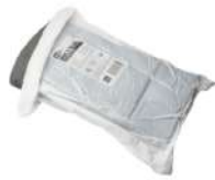
Duct Seal Compound 5 lbs/pac Sealers