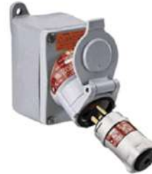
Explosion-Proof Receptacle, EFS Series 20 Amp, Appleton