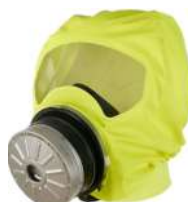
Dräger PARAT® 7500 Escape Hood - 7520 (Soft Pack) R59427