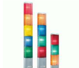
StackLightTM - Edwards Signaling