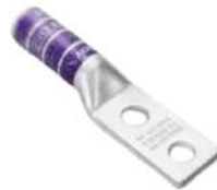
Cable Lug 2 hole 6 awg x 1/2"