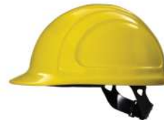
Honeywell North Zone™ Hard Hat Cap