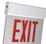
Exit Light 120/277 V Mirror Type ELXTEU-2-G-MA-EM