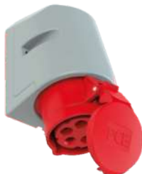
CEE-wall mounted socket 16/32A