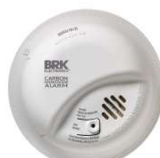
CO5120BNA 120V Hardwired Carbon Monoxide Alarm With Battery Backup