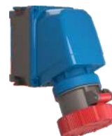
X-CEE Safety Performance industrial sockets in technopolymer from 16A to 125A, IP66/ IP67/IP68/IP69 16/32A GRIP by Palazzoli