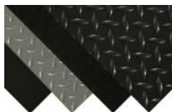
Switchboard Matting By M+A