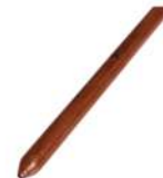
Ground Rod 3/4" x 10 ft Furse RB 335