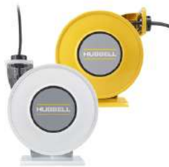
inREACH™ Cord Reels Re-designed mounting bracket allows for effortless installation