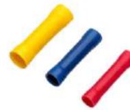
Pre-Insulated Butt Splice Connector 4-6 mm2 x 6.8 mm Dia