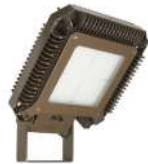
Emerson - Areamaster™ Generation 2 HL LED Luminaires provide lumen output levels of 24,000 to 38,000 lumens (1000 to 1500 Watt HID equivalents)