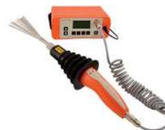
Elcometer 266 Holiday Detector