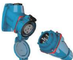
Industrial plugs & Socket Outlets by Marechal Electric