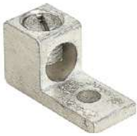
1/0 (50 mm2) One Hole La Type