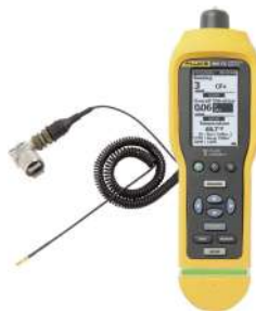
EXTERNAL VIBRATION SENSOR FOR VIBRATION METER FLUKE 805ES