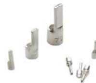
Cable Lug Pin Type Uninsulated 10mm2