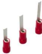
Pre-Insulated Terminal Blade 1.5 mm2 x 18 mm