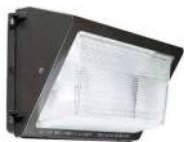
SATCO Wall Pack Outdoor LED Lights - 39 Watt