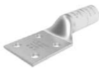
Cable Lug 4 hole 1000 mcm x 1/2"