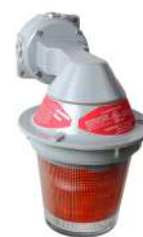
107XBR XTRA-BRITETM LED Hazardous Location Beacon - Edwards Signaling