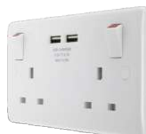
USB Charging Sockets by British General