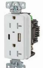
USB-C® PD Receptacles Charge laptops and devices faster with Power Delivery USB, up to 55W