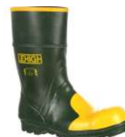
Safety Boot Unisex Steel Toe Rubber Hydroshock Waterproof Dielectric Work