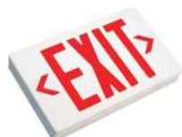
Exit Light 120/277 V EZXTEU 2 G W EM Double Face Green