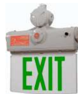
Explosion Proof Edge Lit LED Exit Sign Red and Green