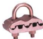
Ground Conn U Clamp 3/4" x 2/0 250 MCM 3 way Burndy