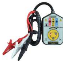
BESANTEK Phase Rotation Tester with Open Phase Checker - BST-PR10