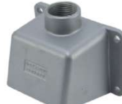
Mounting Box 3/4", 30 Amp, Appleton