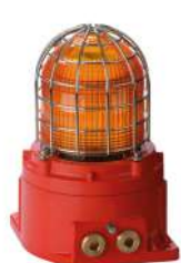
GNExB2L LED Multifunction Beacon | TOMAR Electronics