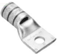
Cable Lug 2 hole 777 mcm x 1/2"