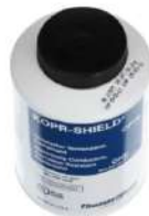
Kopr-Shield CP 16 T&B 16 oz Can UI U.S.A