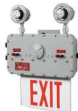
Explosion Proof LED Exit Sign and Emergency Light