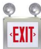
Class 1 Division 2 Hazardous Location Exit Sign Combo. It provides emergency backup power to the exit sign for at least 90 minutes, and only requires 48-hours to fully recharge