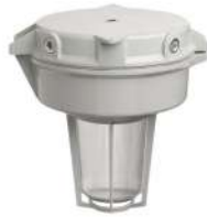
42W CFL Hazardous Location Light with Emergency Battery Backup