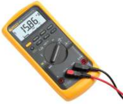
Fluke 87V TRMS Industrial Multimeter