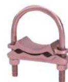
Ground Conn U Clamp 1" x 4" - 2/0 AWG 2 way Burndy