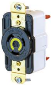
Twist-Lock® Edge Series Improve installation time by over 80% with screwless terminations