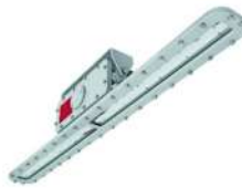
Light Fixture LED 69 W 120-277V RIG-A-LITE