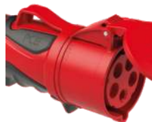
CEE-connectors 16/32A series