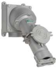
Appleton 200 Amp Powertite series by Emerson