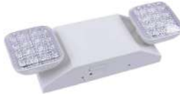
Emergency Light Dual Head LED 120-347 VAC Kallayil