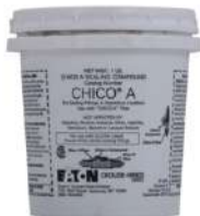
Sealing Compound Chico A 48 OZ + Fiber 1 lb Eaton Crouse Hinds