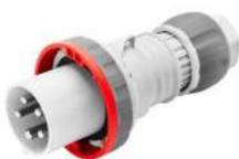
STRAIGHT PLUG HP - IP66/IP67/IP68/IP69 - 2P+E 63A 380-415V 50/60HZ - RED - 9H - MANTLE TERMINAL by Gewiss