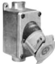
Explosion-Proof Receptacle, EFSC Series 20 Amp, Appleton