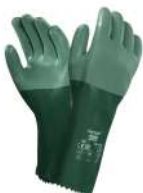
Ansell AlphaTec® 08-354 liquid-proof industrial glovesonate, Clear Lens - 9164.275