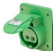
10° ANGLED FLUSH-MOUNTING SOCKET-OUTLET - IP44 - 3P 16A 20-25V and 40-50V 100-200HZ - GREEN - 4H - SCREW WIRING by Gewiss