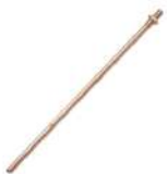
Air Rod 16 mm x 3000 mm long Furse RA 250