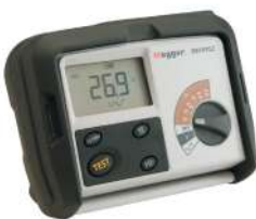
TERMINAL EARTH RESISTANCE AND SOIL RESISTIVITY TESTER MEGGER DET4TC2