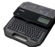
FERRULE PRINTER MK5000 CANON