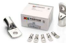
Partex Cable Lugs