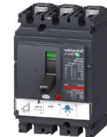
Schneider Arc Fault Circuit Breakers, 630 A, 690V, MG.LV432893