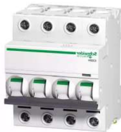
Schneider Acti9 iC60H 4P C 6A MCB