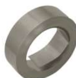
SS Embossing Tape SS 316 1/2" X 21 ft Band-IT 10 Pcs/Box