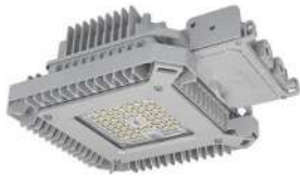
Emerson - New LED Solution for Retrofitting High Bay Lighting