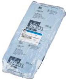
Duct Seal Compound 5 lbs/pac Ideal