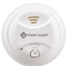
0827 BRK IONIZATION BATTERY POWERED SMOKE ALARM WITH 10-YEAR SEALED LITHIUM BATTERY