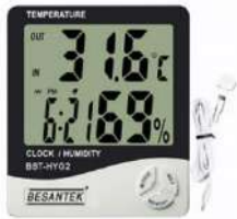
BESANTEK Large Display Thermo- Hygrometer - BST-HYG2