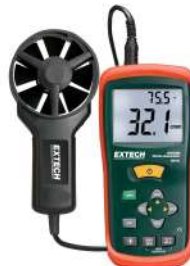
Mini Thermo-Anemometer Extech AN 100