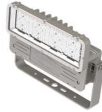
Flood Light Fixture LED 122w 120-277v Killark - Marine Atex