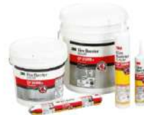
Fire Barrier Sealant 3m CP 25WB + Red