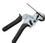
SS Cable Tie Gun SSAT Partex