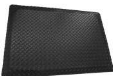
Rhino Switchboard Matting