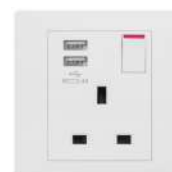
13A SINGLE SWITCHED SOCKET + USB by hager