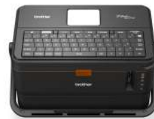
Brother PT-E850TKWLI Label Printer