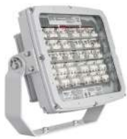
Flood Light Fixture LED 132W 100-277VAC RIG-A-LIGHT, Explosion Proof Hazardous Location